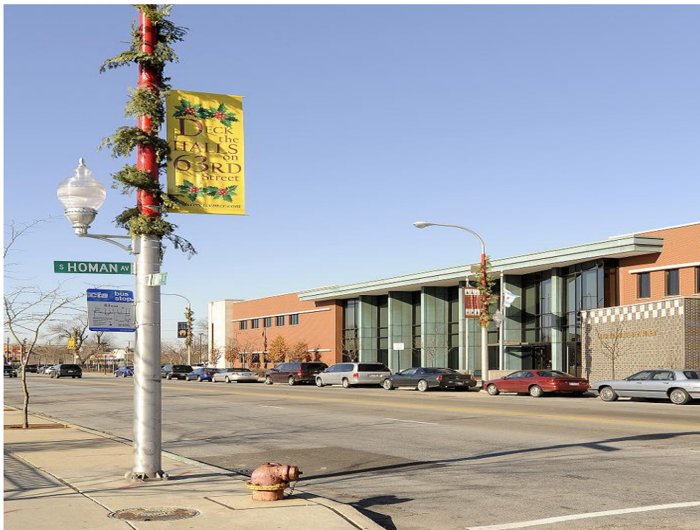
EXAMPLE OF LIGHT POLE BANNER

Greater Southwest Development Corporation is looking to begin working with the selected vendor during the first quarter of 2020.